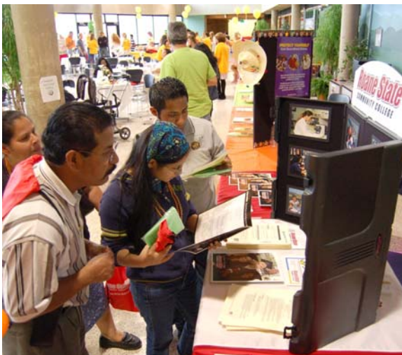
Visitors at Welcome Festival

The events included information about community and education services as well as food and entertainment. Festivals were held in Roane County, Lenoir City, Crossville and Oak Ridge. Combined, the events attracted about 660 visitors.