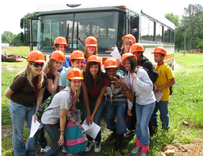
APSU Summer Academy participants